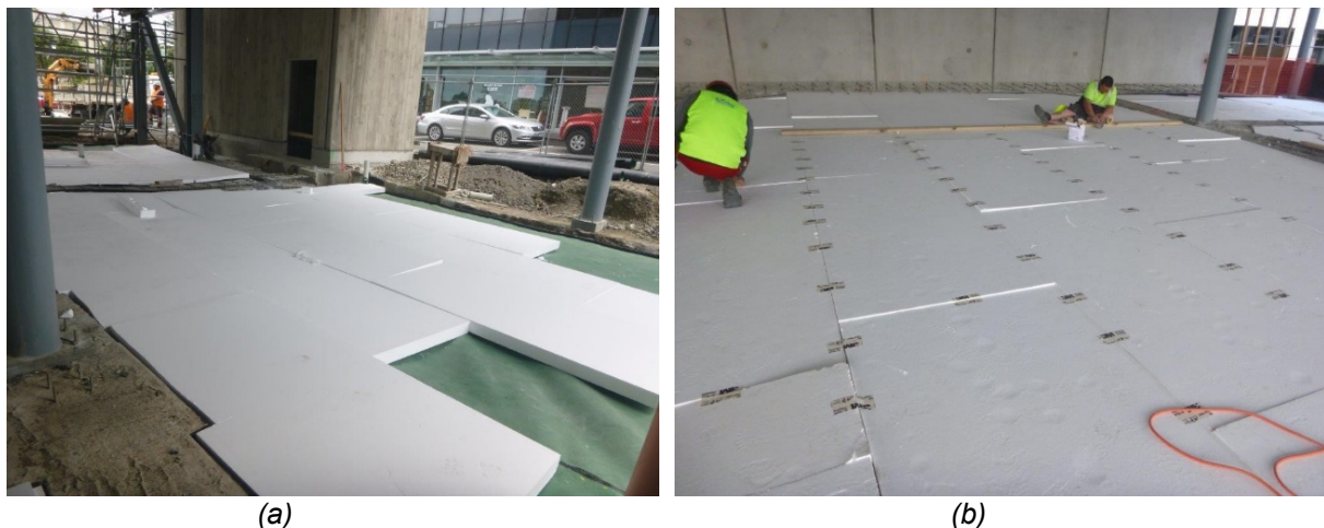
Figure 6. (a) EPS fill on HDPE membrane; and (b) Closely taped EPS fill

It was noted by the Engineer that the membrane (which had been installed and tested) was regularly damaged by site personnel. Frequent repair (in conjunction with re-testing) of the membrane was time consuming and could reduce the performance of the gas membrane. Following numerous discussions with the site contractor, placement of blocks of expanded polystyrene (EPS) lightweight fill on top of the membrane was considered the most practical solution to prevent further damage – refer Figure 6(a). The lightweight fill blocks were closely butted and taped to further minimise physical contact with the HDPE membrane, as shown in Figure 6(b). Subsequently the HDPE membrane remained undamaged.