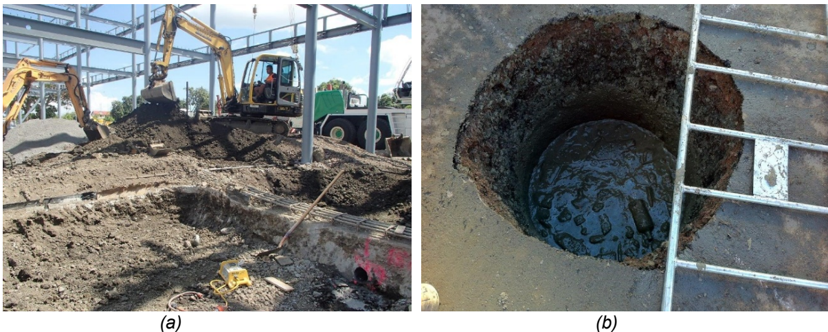
Figure 4. (a) Excavation within landfill; and (b) Landfill refuse observed

Regular observations were undertaken by a Geotechnical Engineer during ground excavations, and geotechnical comments on the stability of trench excavation within soft refuse were provided. Where issues or conflicts arose between consented design and its constructability/excavatability, practical and cost-effective solutions were provided to the contractor.