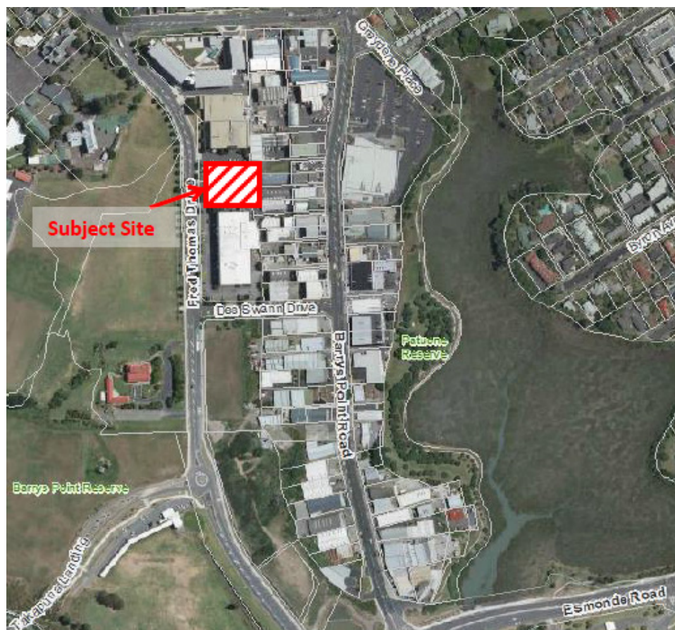
Figure 1. Location of the site