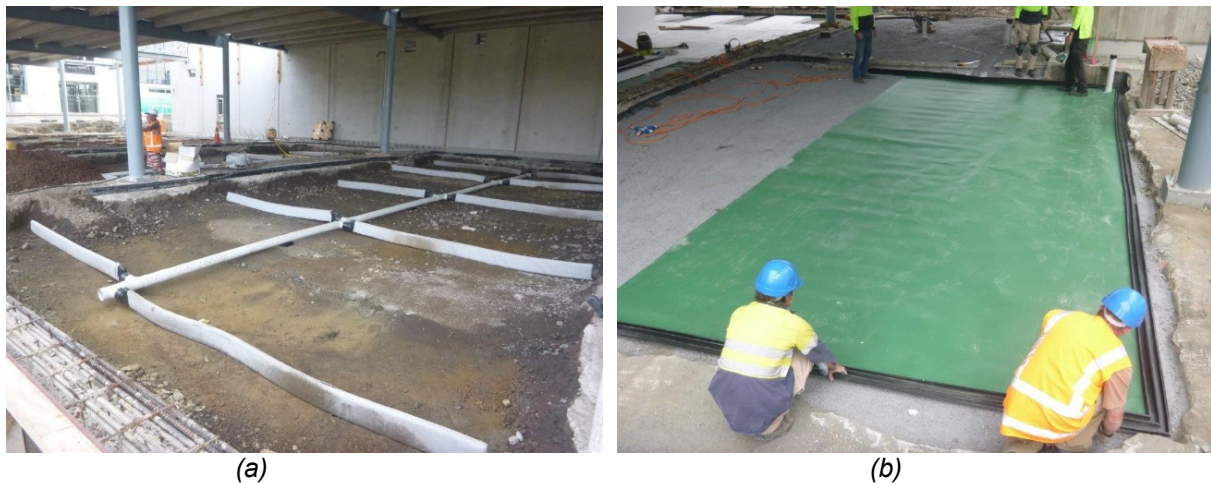
Figure 5. (a) Gas collection network; and (b) Placement of HDPE membrane

It was noted by the Engineer that the membrane (which had been installed and tested) was regularly damaged by site personnel. Frequent repair (in conjunction with re-testing) of the membrane was time consuming and could reduce the performance of the gas membrane. Following numerous discussions with the site contractor, placement of blocks of expanded polystyrene (EPS) lightweight fill on top of the membrane was considered the most practical solution to prevent further damage – refer Figure 6(a). The lightweight fill blocks were closely butted and taped to further minimise physical contact with the HDPE membrane, as shown in Figure 6(b). Subsequently the HDPE membrane remained undamaged.