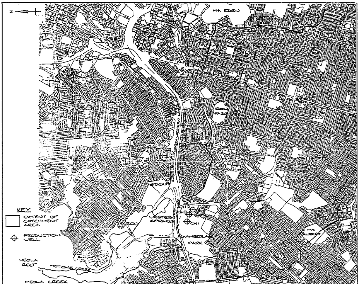
Figure 3. Plan of Western Springs scheme area.

It was determined that abstraction rates of 5000 m 3 /day to 7000 m 3 /day were feasible from both technical and environmental viewpoints. A decision was made by the ACC to apply for 5000 m 3 /day for municipal supply as this would allow all three schemes to use the same water purification works design as well as being a long term economically viable rate. Riley Consultants Ltd. [3] report on the proposed scheme contains details of the investigation and modelling.