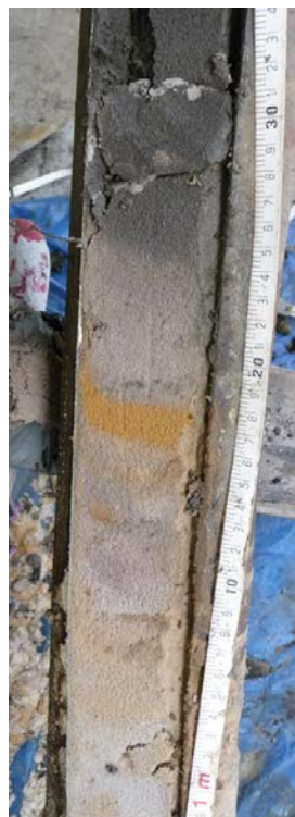
Figure 6: Sand