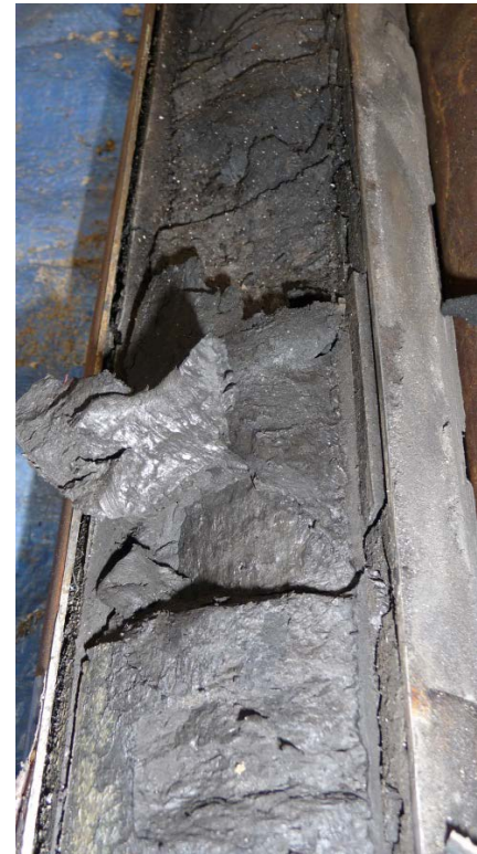
Figure 7: Very Stiff Fissured Clay

In the case of the smaller diameter tubes, most of the sample at any given depth/material range will be utilised for either ASS/geochemical or geotechnical (classification) testing. However, for the 100 mm diameter tube, there is normally sufficient sample to do both. Moreover, with the larger diameter tube, material volumes suitable for compaction tests or for sluicing of fines to provide sufficient material for simulation test modelling