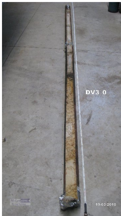
Figure 5: Recovered Core Tube Split

The vibrocore tube is usually cut into manageable lengths (up to 3 m) and transported from the barge for processing, or processed on the barge (refer Figure 4 above). The processing comprises splitting the core tube longitudinally while avoiding cutting into the sample, logging, photographing and sub-sampling. It is noted that some practitioners have been known to support the tube vertically from the crane and ‘vibrate’ the sample into a plastic ‘sock’. This method of extraction is not recommended, due to sample mixing and disturbance. A series of some exposed cores is shown in Figures 5-7 below.