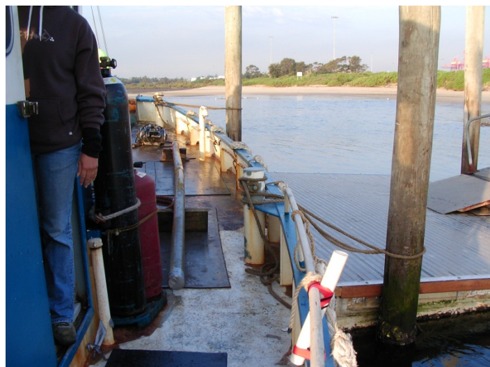
Figure 2: Recovered Vibrocore with Sealed ends on Deck

In the sampling exercise, the tube with vibrocorer head attached (as shown on Figure 1 above), is lowered to the seabed from a deck crane; the vibrocorer is started and slack given to allow penetration of the corer until either refusal or full penetration of the tube length attached. The vibrocorer is switched off and the tube recovered by