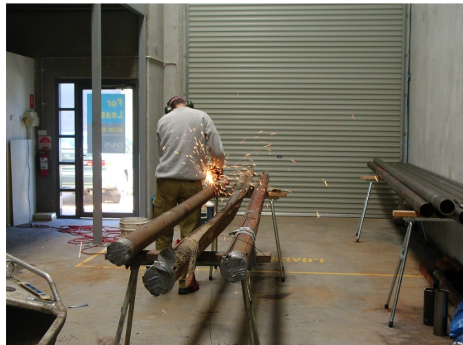
Figure 4: Cutting the Core Tubes