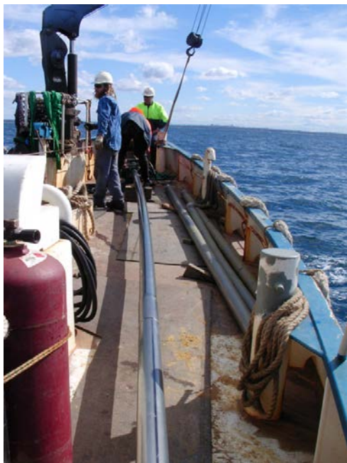
Figure 1: 9 m Steel Vibrocore ready to deploy

The vibrocorer uses a range of vibrating amplitude and frequency, plus 'head weight' in order to advance thin wall tubes through generally loose to medium dense sands and very soft to firm muds (silt and clay). Mostly the tubes so advanced comprise 50 mm to 80 mm diameter, up to 6 m length aluminium tube. The vibrocorer is traditionally used for sampling very soft to soft/very loose to loose sediments, but with the use of steel tubes can be adapted for stronger strata.