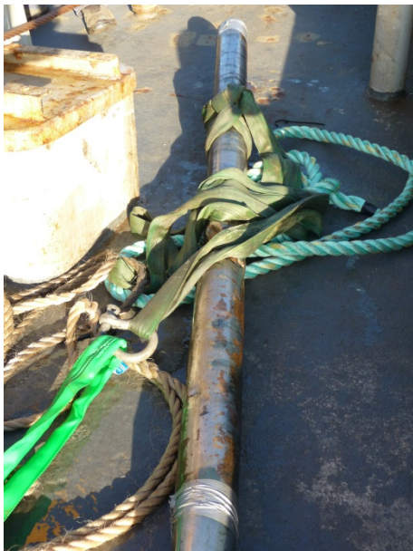
Figure 3: Recovered Core Taped at Seabed