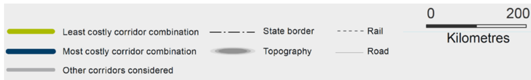
Figure 5: Least costly and most costly corridor combinations (AECOM, 2011)

On the basis of proposed fares, frequency of services and travel times, patronage demand forecasts suggest the preferred corridors could carry approximately 54 million passengers per annum in 2036. Eight million people are projected to travel between Sydney and Melbourne and 3.5 million between Brisbane and Sydney. These forecasts assume inter-city HSR fares comparable with inter-city air fares (AECOM, 2011).