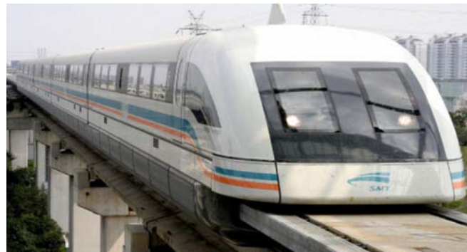
Figure 3: A Japanies Maglev train