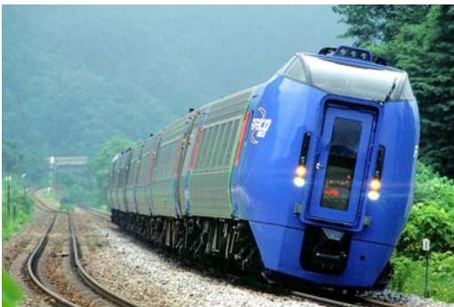
Figure 2: A Japanese tilting train

Magnetic levitation (MAGLEV) technology was first tested in the 1970s, but it has never been in commercial operation on long-distance routes. The technology relies on electromagnetic forces to cause the vehicle to hover above the track and move forward. In practice, the aim is for an operation speed of 500 km/h. In 2003, a MAGLEV test train achieved a world record speed of 581 km/h. The special infrastructure required for MAGLEV trains means high construction costs and no compatibility with the railway network. The MAGLEV is mostly associated with countries like Japan (Figure 3) and Germany, where MAGLEV test lines are in operation. In China, a short MAGLEV line was opened in December 2003 connecting Shanghai Airport and the Pudong a financial district in Shanghai, with trains running at maximum speed of 430 km/h.