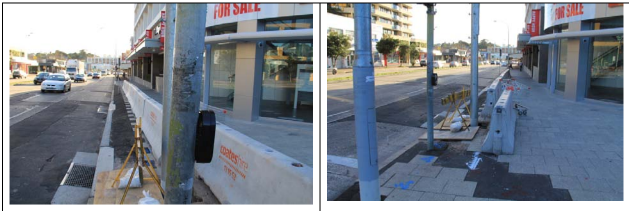
Figure 5: The temporary repairs to the pavement and footpath shows the results of a deep wall excavation incident.

Some geotechnical practitioners are seeking accreditation to work on building and road projects, but this may not be the best solution. The AGS and the professional re-insurance industry, along with local government support, must consider ways to ensure that the engagement of geotechnical professionals (i.e. the design brief) covers both the design of deep walls and inspection of the works during excavation. If this is not adhered to by the geotechnical profession, insurance coverage could be voided.