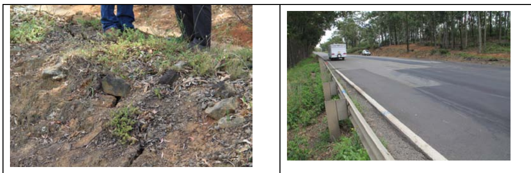
Figure 7: The view of the crack in the road easement (left) and temporary repairs to the pavement (right) on the New England Highway.

Whilst a significant amount of resources over the last 4 years has been directed at maintaining and designing new pavements subject to mine subsidence, open cut mines have now arisen as another primary concern for the road network. In early January, heavy rain followed a blast event at an open-cut mine resulting in a crack being formed from the face of the mine across the New England Highway. As shown in Figure 7, the 50 mm wide crack meandered down the hill and across the three-lane highway. It was fortunate the location of the crack had no streams running across the path of the crack. Monitoring was set up adjacent to the road site, and data from the instruments indicated that the width of the crack increased on average 4 mm per week until a large buttress was constructed against the 100 m high exposed slope. Movement monitoring and repairs to the highway are ongoing.