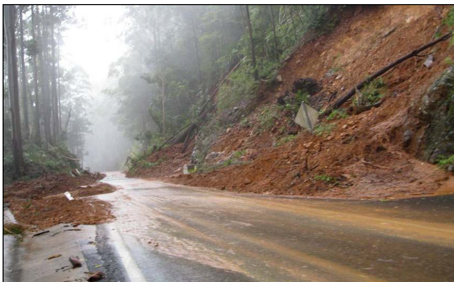
Figure 3: One of the 100 slips on the Waterfall Way in 2009.