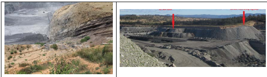
Figure 8: The view of the western face of the open-cut mine (left) and the buttress under construction (right).

The mine excavation was kept just outside the 100 m limit specified in NSW legislation for open-cut mines, and this limit is now to be reviewed by RMS and RailCorp to ensure that these types of events do not occur again.