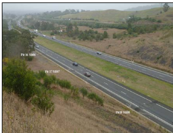
Figure 6: The view of the Hume Highway after the installation of the compression slots in the bound subbase in both carriageways.

In 2012 RMS updated its “Mine Risk Assessment Guideline” (RMS, 2012c). The guideline facilitates the assessment of risks posed to relevant assets of RMS from proposed mining activities. These mining activities could include but are not limited to either underground subsidence or open cut mining. It also provides a set of tools to enable a preliminary assessment of these risks to be determined and provides directions as to the appropriate response to the mining proposal. This includes escalation of decision making when a preliminary risk assessment indicates unacceptable risks.