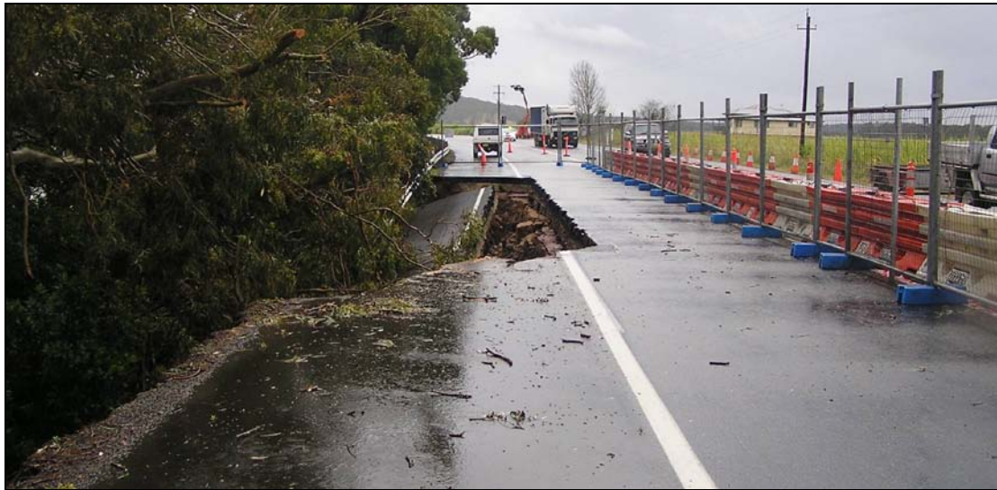
Figure 1: The damage to the Pacific Highway at Byrons Lane north of Grafton due to a riverbank slip in 2009.