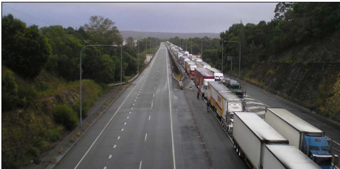
Figure 2: Heavy vehicles waiting for northerly access on the Pacific Highway at Raleigh in 2009 due to inundation.