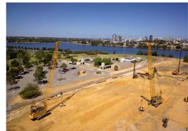
Dynamic Compaction and Wick Drains at Perth Stadium - Keller Ground Engineering