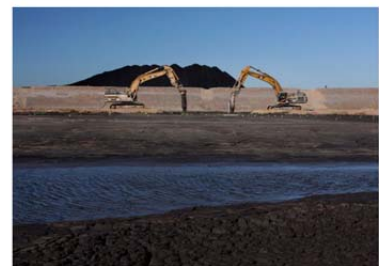
Mass Soil Mixing at NCIG - Keller Ground Engineering