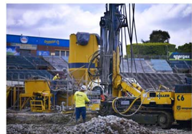
Jet Grouting over canopy of Brisbane tunnel - Keller Ground Engineering