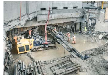
Canopy Tube installation at Wynyard Walk - Keller Ground Engineering